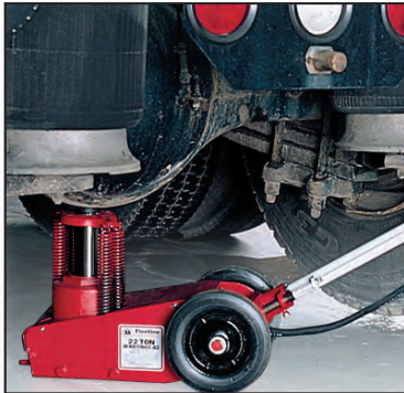
Double Spring Return